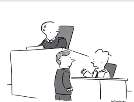
“I wouldn’t call it identity theft, I just self-identify as other people.”