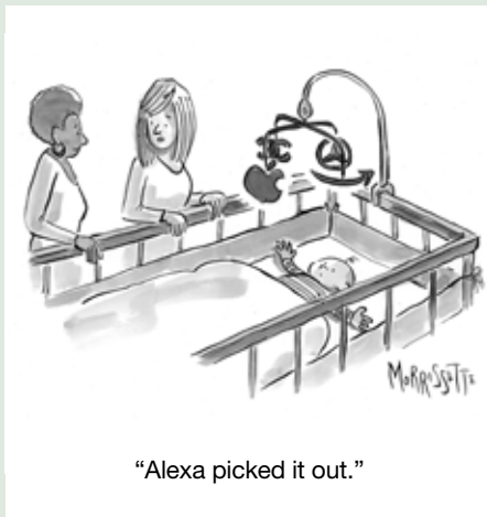
“Alexa picked it out.”